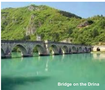
Bridge on the Drina